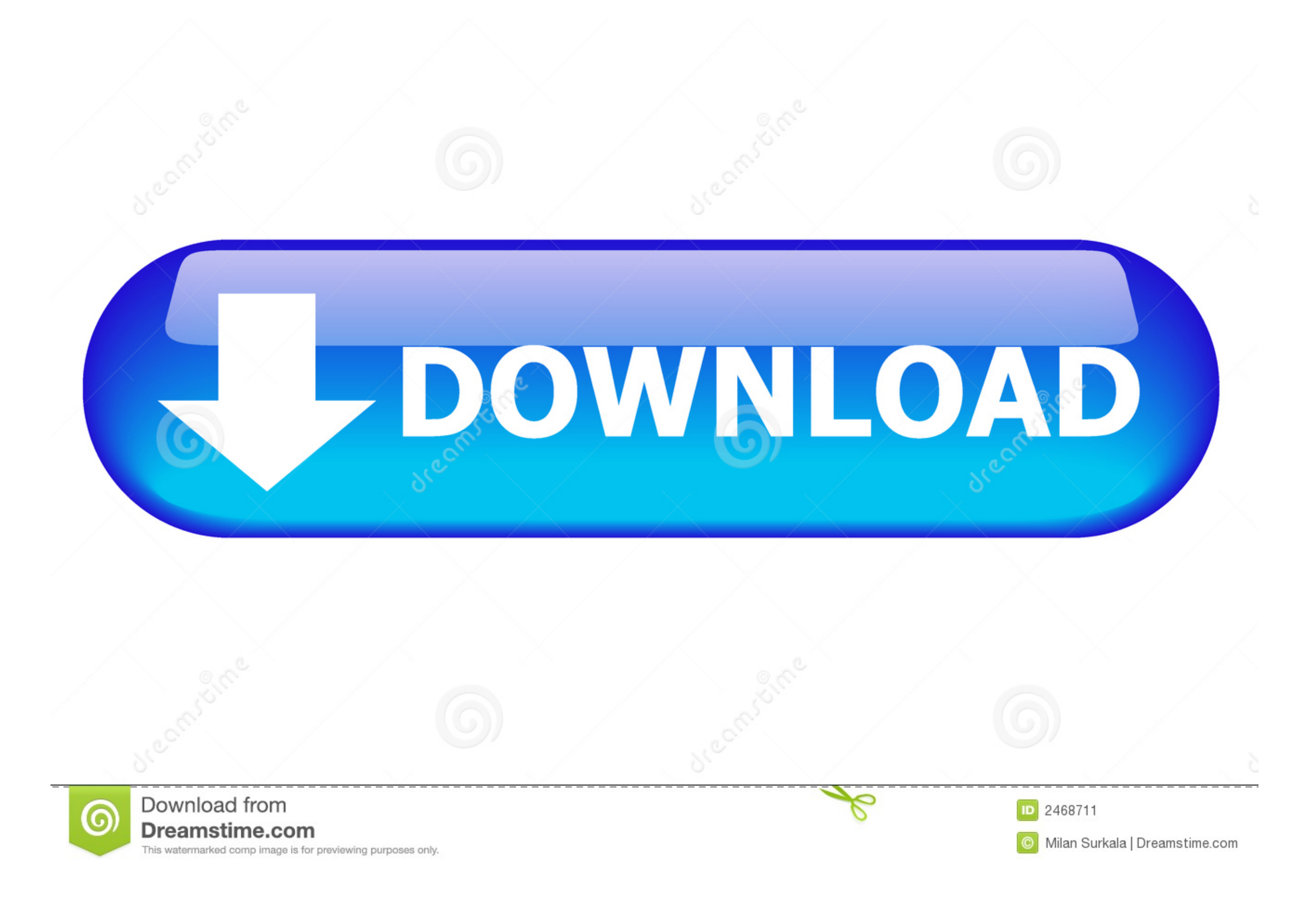
Futurepoint Leo Star Professional Cracked Rar